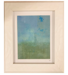
Midsummer Marsh #1

Facebook: gk fine art paintings Instagram: @gkfineartpaintings