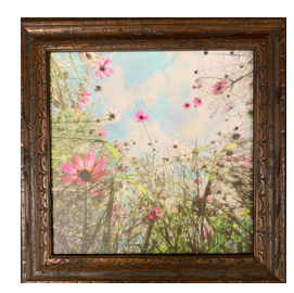
You Know What They Say