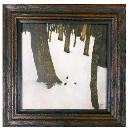
All Are Welcome