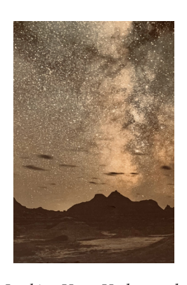
Looking Up to Understand

In our world today, I can't help but wonder how much less posturing and swaggering, bullying and social anxiety there might be if, collectively, we began valuing our "screen time" less and our "dark sky time" more—for the increased opportunity that could give us for "looking up."